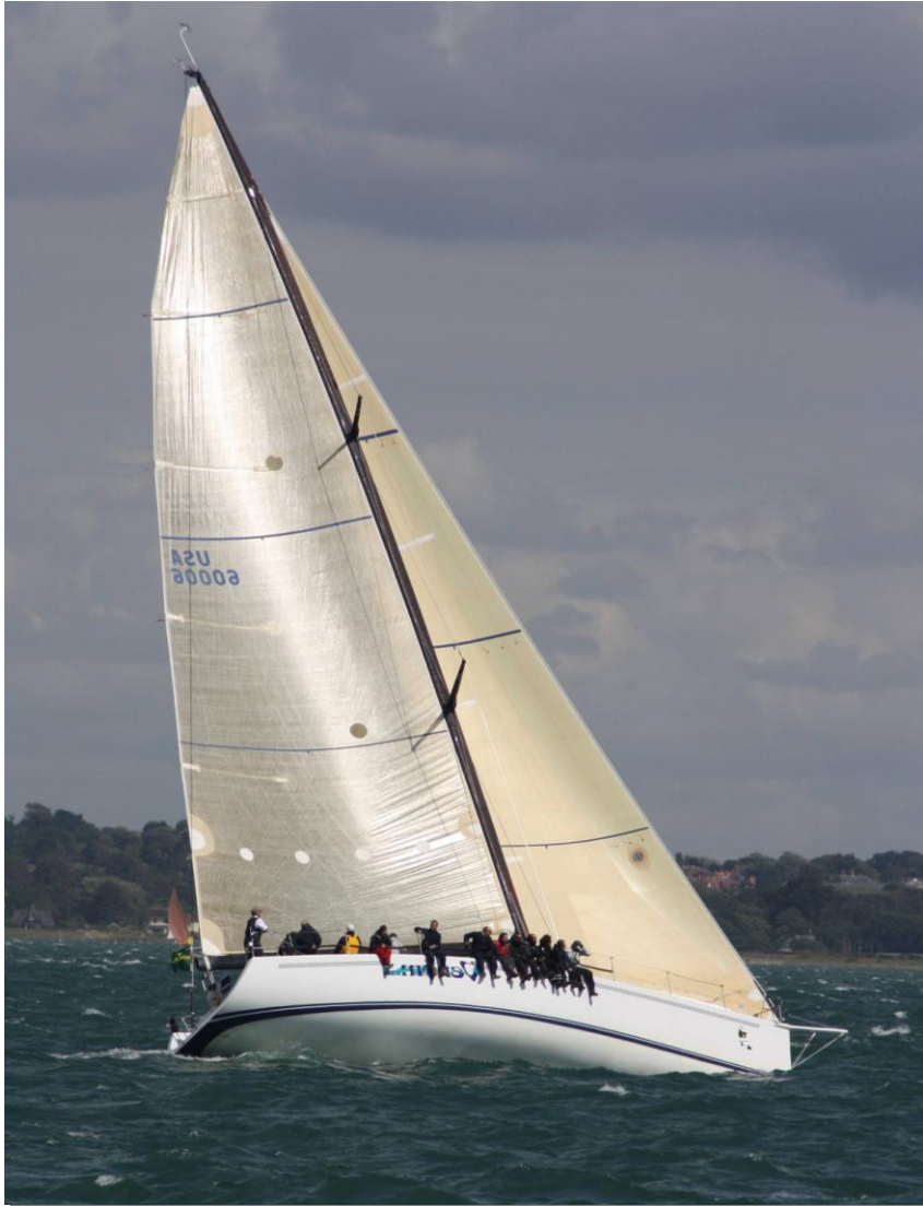
Venomous – Carroll Marine 60 Winner 2011 RORC Series

Windward Sailing Yacht Charters has had many years of experience in organising crews for both the Fastnet Race and other longer distance races, specialising in high performance yachts that will finish the race at least a day ahead of most rival yachts on the longer offshore campaigns.